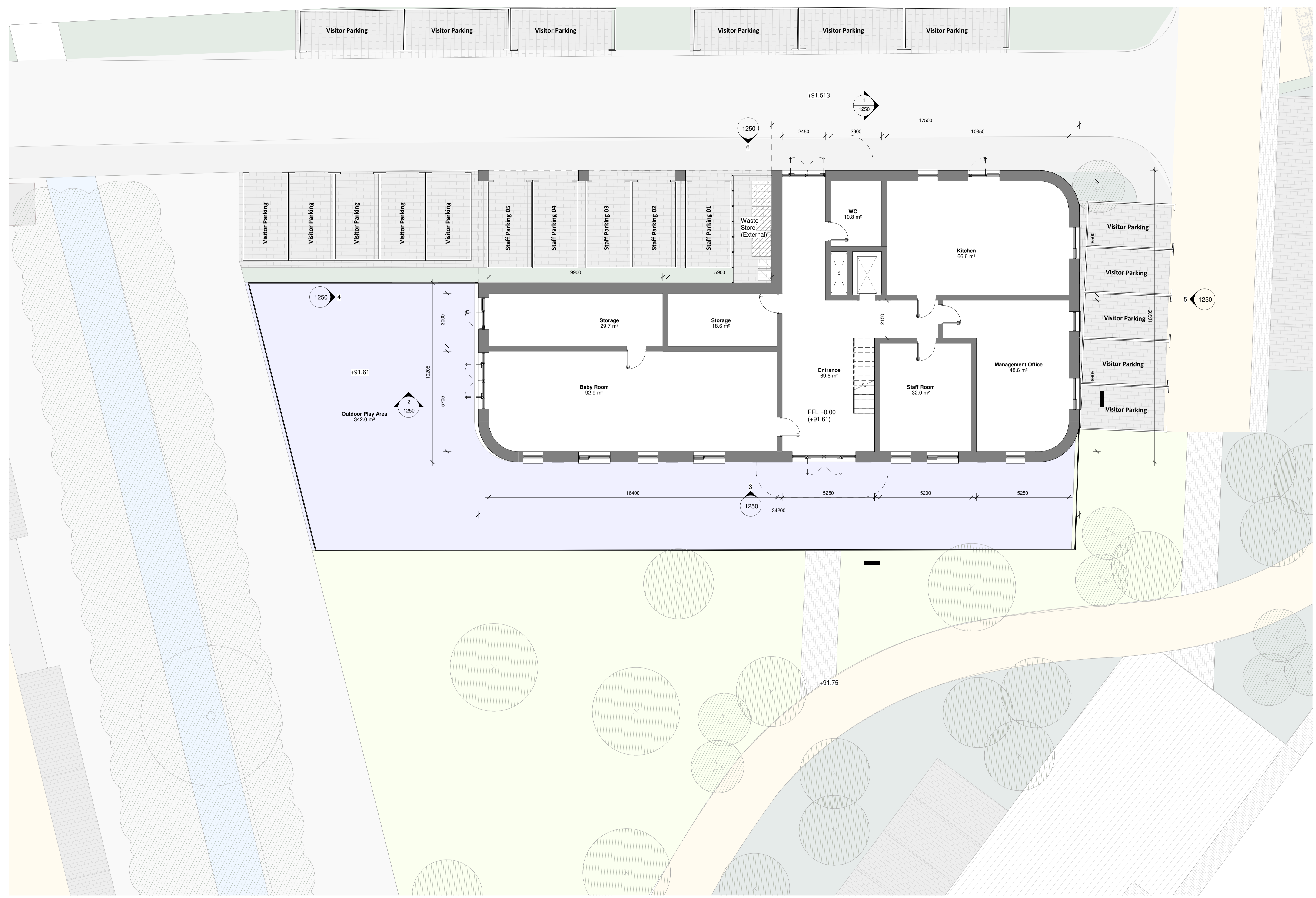
1 Ground Floor Plan 1 : 100